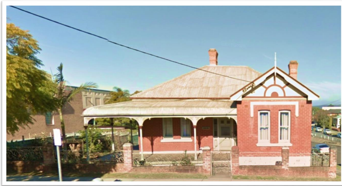
'Invermay' corner Wynter and Pulteney Streets, Taree.